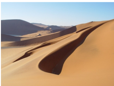
Desert outside Swakop

The coast with its desert hinterland offers many options, both for adventure and for relaxation.