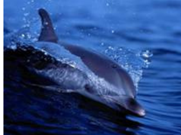
Dolphin sightings on cruise