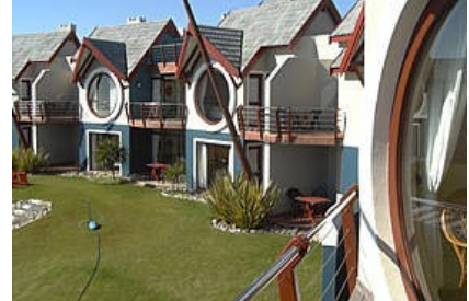
Beach Lodge, Swakopmund

We leave the Namib Desert and Sossusvlei behind after an early breakfast and travel west towards the historic town of Swakopmund. The morning is spent exploring the Kuiseb Canyon, and having lunch en route. Passing through Walvis Bay we will stop at the Lagoon which is renowned for large concentrations of waders, flamingos and shore birds. The afternoon can be spent at your leisure exploring the town.