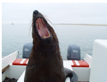
Seal on cruise