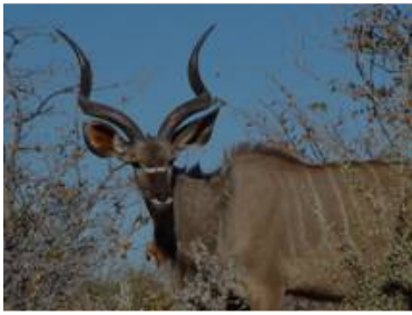
Kudu Bull in Damaraland