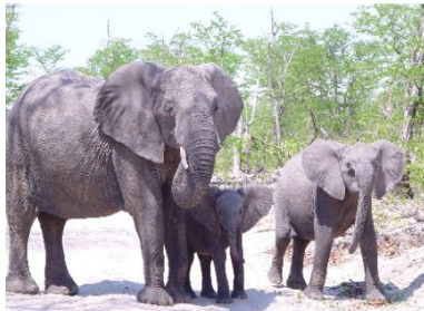
Elephants in Etosha