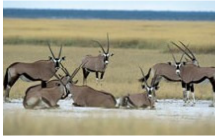
Gemsbok near Onguma

more strenuous activity is required, then relaxing on your patio and reading a good book should provide you with all the exercise you may need.