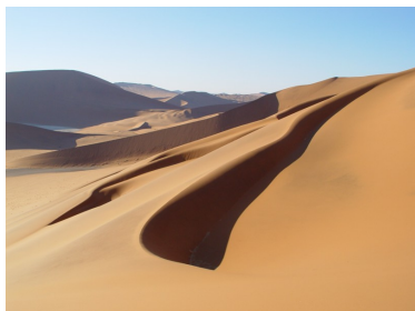
Desert outside Swakopmund

The coast with its desert hinterland offers many options, both for adventure and for relaxation.