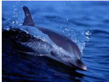
Dolphin sightings on cruise