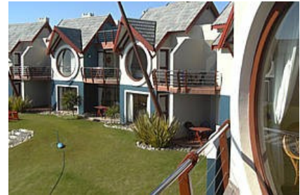
Beach Lodge, Swakopmund

We leave the Namib Desert and Sossusvlei behind after an early breakfast and travel west towards the historic town of Swakopmund. The morning is spent exploring the Kuiseb Canyon, and having lunch en route. Passing through Walvis Bay we will stop at the Lagoon which is renowned for large concentrations of waders, flamingos and shore birds. The afternoon can be spent at your leisure exploring the town.