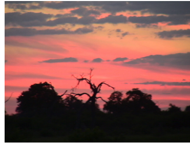
Sunset in Namibia